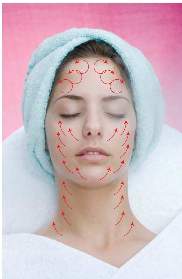
Indirect High Frequency movements