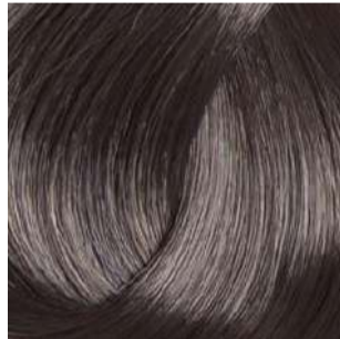
5A / 5.1 LIGHT NATURAL ASH BROWN