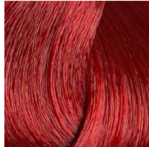
RED RED INTENSIFIER