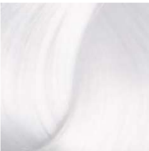
BB / 0.00 BLONDE BOOSTER