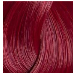
HLVR SUPER INTENSE VIOLET RED