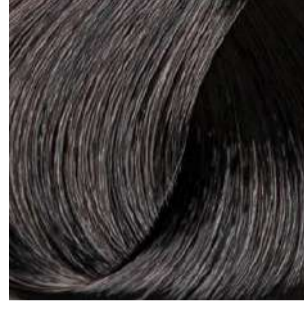
3N / 3.0 DARK BROWN