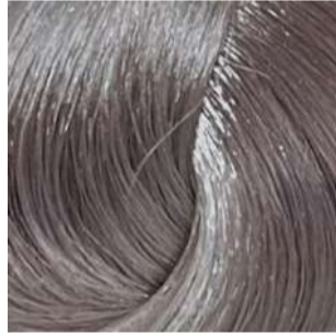
8VM MEDIUM VIOLET