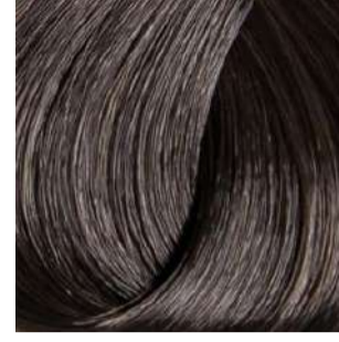
4N / 4.0 BROWN