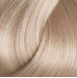
HLN / 11.0 HIGH LIFT NATURAL BLONDE