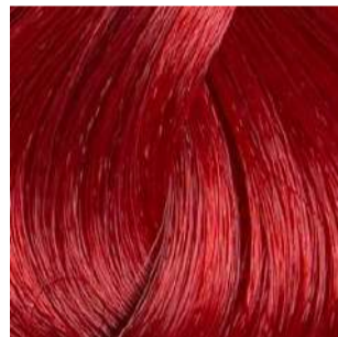
HLR SUPER INTENSE RED