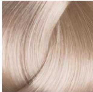
12A / 12.1 SUPER ASH BLONDE