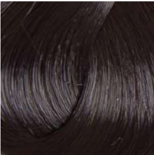
4A / 4.1 MEDIUM NATURAL ASH BROWN