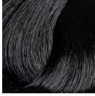
1N / 1.0 BLACK