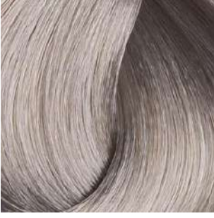
GREY SMOKEY GREY