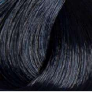
1A / 1.1 BLUE BLACK