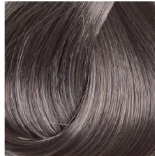
6A / 6.1 DARK NATURAL ASH BLONDE