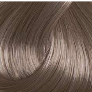
9A / 9.1 VERY LIGHT NATURAL ASH BLONDE