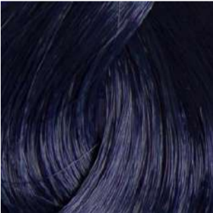
BLUE BLUE INTENSIFIER