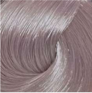
9VM PLATINUM VIOLET