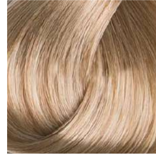
9N / 9.0 VERY LIGHT BLONDE