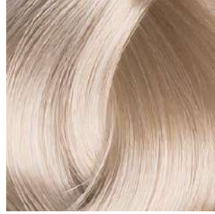
HLB / 11.13 HIGH LIFT BEIGE BLONDE