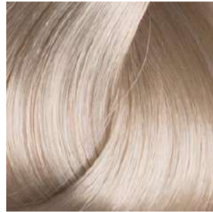
12V / 12.2 SUPER PLATINUM BLONDE