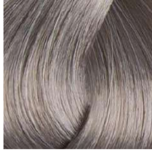
SILVER SILVER GREY