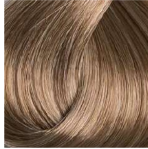
8N / 8.0 LIGHT BLONDE