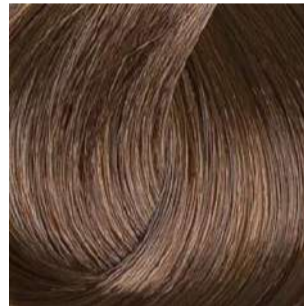
7NN / 7.00 COOL NATURAL MEDIUM BLONDE