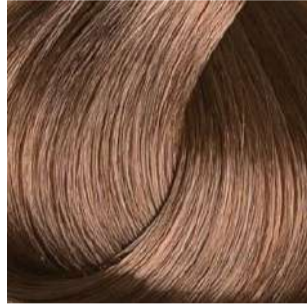
7N / 7.0 BLONDE