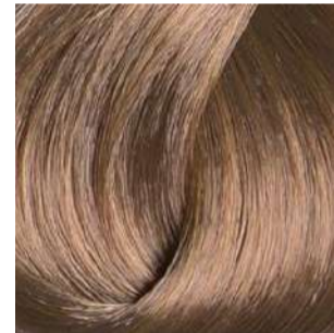
8NN / 8.00 COOL NATURAL LIGHT BLONDE