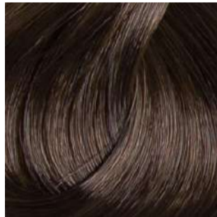
6NN / 6.00 COOL NATURAL DARK BLONDE