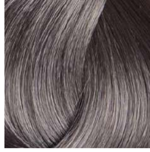
SLATE SLATE BLUE