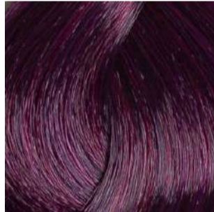
VIOLET VIOLET INTENSIFIER