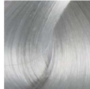
SILVER SILVER INTENSIFIER