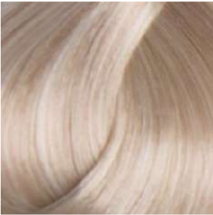
12N / 12.0 SUPER NATURAL BLONDE