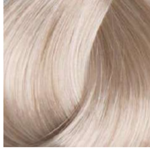
HLA / 11.1 HIGH LIFT ASH BLONDE