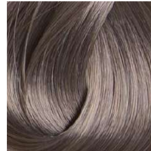
7A / 7.1 MEDIUM NATURAL ASH BLONDE