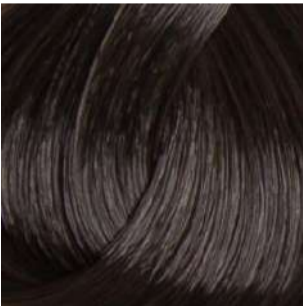
5NN / 5.00 COOL NATURAL LIGHT BROWN