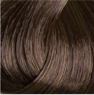
6N / 6.0 DARK BLONDE