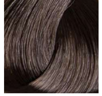
5N / 5.0 LIGHT BROWN