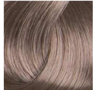
8A / 8.1 LIGHT NATURAL ASH BLONDE