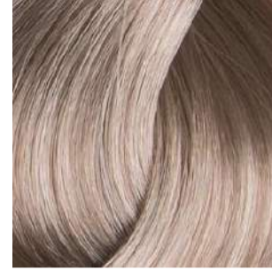
HLP / 11.2 HIGH LIFT PLATINUM BLONDE